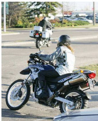
Cute couple — Angelina and Brad

Insiders claim the lilo-lipped star, rumoured to be romancing Hollywood heartthrob Brad Pitt, is planning to use the bike to continue her humanitarian work around the world.