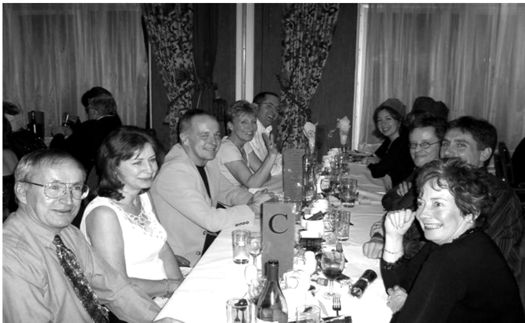
A good time being had by all at the BWAM Christmas festivities held at the Marsham Court Hotel.